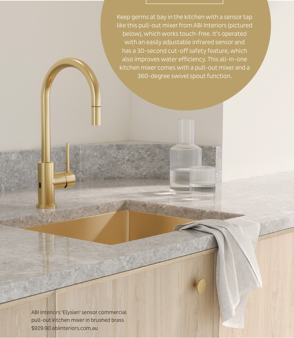
ABI Interiors 'Elysian' sensor commercial pull-out kitchen mixer in brushed brass $929.90 abiinteriors.com.au

Keep germs at bay in the kitchen with a sensor tap like this pull-out mixer from ABI Interiors (pictured below), which works touch-free. It's operated with an easily adjustable infrared sensor and has a 30-second cut-off safety feature, which also improves water efficiency. This all-in-one kitchen mixer comes with a pull-out mixer and a 360-degree swivel spout function.